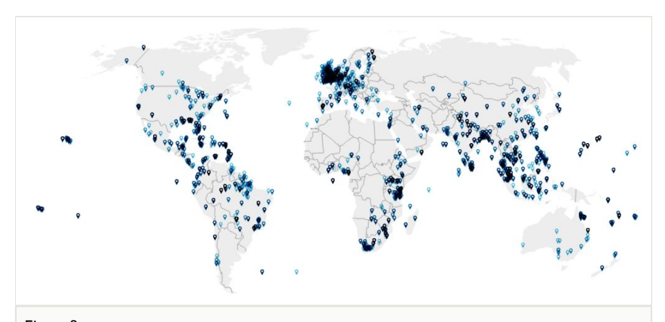
Figure 2. Locations of valuation study sites included in the ESVD.

Table 1 provides an overview of the coverage of ESVD data by ecosystem service (using the SEEA EA reference list) and valuation method. Note that the total number of value estimates summarised in the Table is lower than the total contained in the ESVD because some have not yet been categorised using the SEEA EA reference list. The distribution of data across ecosystem services is far from even, with some services very well represented in the data (e.g. recreation, wild fish and wild animals, ecosystem and species appreciation, air filtration and global climate regulation) and others with almost no value estimates (e.g. disease control, baseflow maintenance, rainfall pattern regulation).